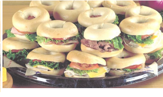
Mini Sandwich Tray