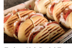
Turkey Club Panini Tray