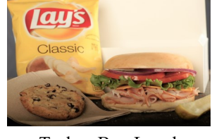
Turkey Box Lunch