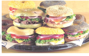
Deli Sandwich Tray