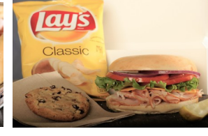
Turkey Box Lunch