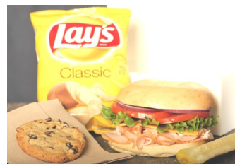
All American Box Lunch