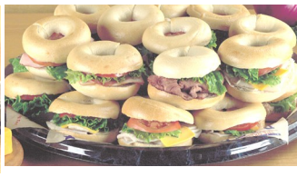
Mini Sandwich Tray