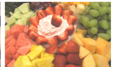
Fresh Fruit & Cheese Tray

Prices subject to change Revised on 03-18-2026